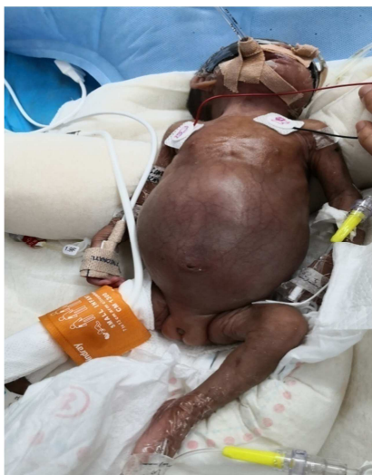
Figure 2. For children with abdominal peng, veins revealed abdominal wall.