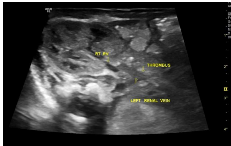
Figure 1. Thrombus in left renal vein

was normal. The echocardiogram was normal. Renal ultrasound with doppler was done, which showed that the left kidney was enlarged (49*28mm) with oedematous and hypoechoic thrombus in left renal vein along with thrombus in the inferior vena cava (Figure 1) with absent colour doppler flow in the left renal vein and reversal of the left renal arterial doppler flow (Figure 2) and supra-renal hypoechoic lesion. Right kidney measured 32*20mm and right renal vein appeared normal & showed normal colour doppler flow. The neonate was diagnosed to have the left RVT. The infant was managed with low molecular weight heparin (LMWH). Blood pressure was higher than the 95th percentile, so oral antihypertensive amlodipine started. Complete blood count, renal function, liver function & APTT, PT/INR were monitored throughout the course. We have treated this unilateral RVT with LMWH for 6 weeks and repeat renal ultrasound & renal doppler done which was suggestive of improved doppler in renal vein as well as in the artery (Figure 3) and baby was discharged successfully with weight of 1800 grams.