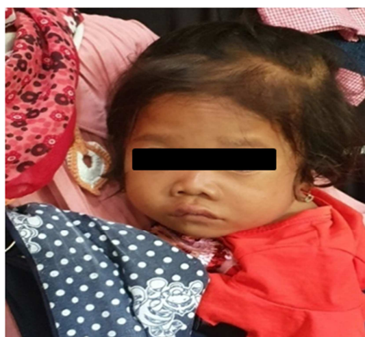
Figure 1. Coarse face, depressed nasal bridge.

There was no history of mother prenatal illness. She was born full term by vaginal delivery with a birth weight of 3,5 kg and length 49 cm. She only got formula milk. Her mother said that she could eat solid food after 2 years old. She can hold her head after 2 years old and sit with support in 4 years old. She only could say syllables not words. On physical examination, patient is alert, blood pressure 90/60 mmHg, pulse rate 90 beat per minute, respiratory rate 22 times per minute, normal body temperature. She had microcephaly 46 cm (below 3 SD according nellhaus head circumference), coarse facial features, narrow palpebral fissure, depressed nasal bridge. There is no goiter. Abdomen is distended without umbilical hernia. Tonus is still normal.