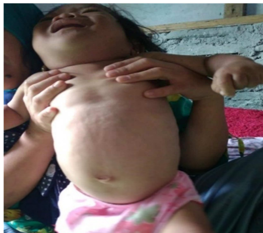
Figure 2. Abdominal distention.

Her anthropometry was still of infantile proportion with a length of 67 cm (height for age below 3 rd percentile of CDC or <-3SD according WHO growth chart), weight of 7,8 kg (weight for age was below 3 rd percentile of CDC and <-3 SD according WHO growth chart), BMI was 17,3 kg/m 2 (0-1 SD), upper and lower segment ratio 1.6:1. Measurement of genetic potential height is around 133-150 cm, mid parental height was is 142 cm and her height is below these potential genetic.